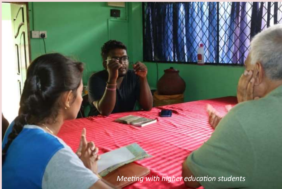
Meeting with higher education students